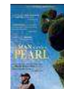
A MAN NAMED PEARL