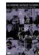
A TIME FOR BURNING